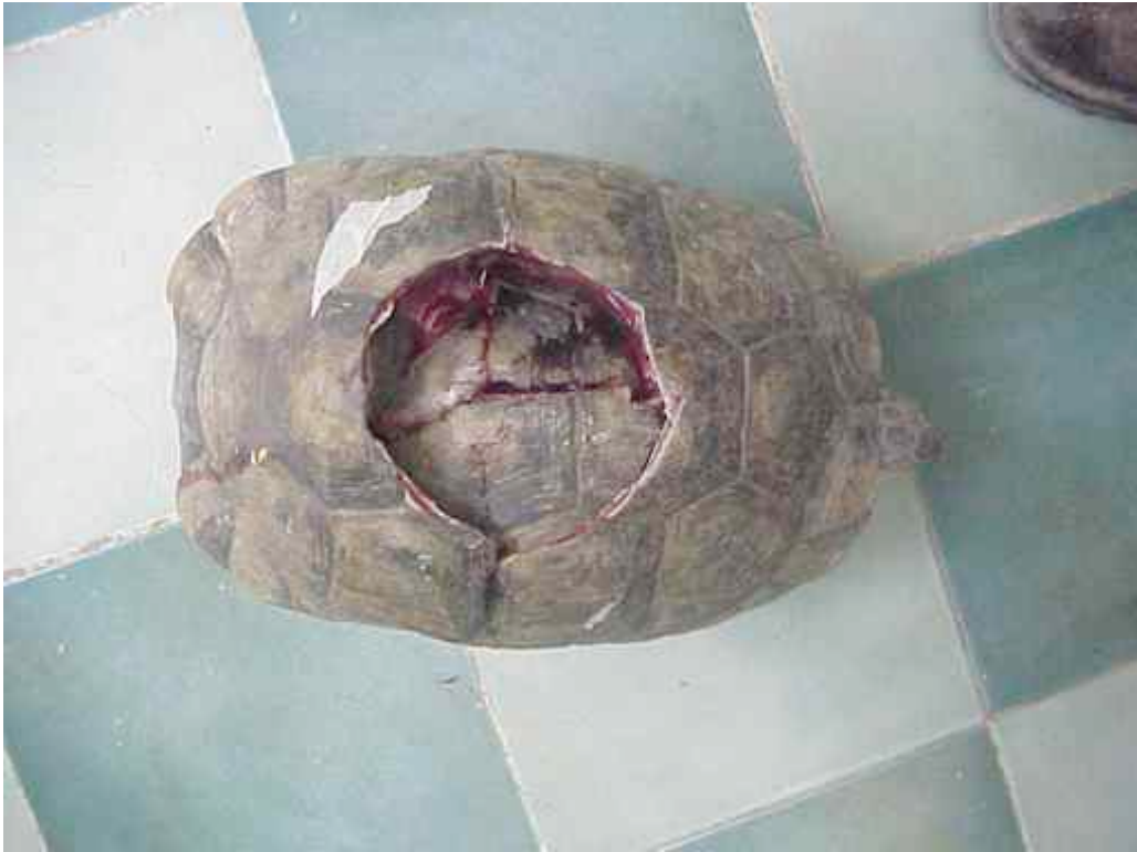
"Sophie" at intake September 30 th 2008